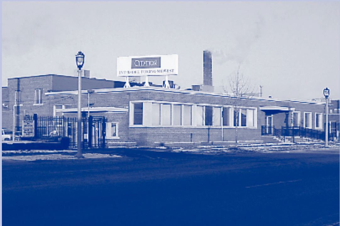
Citation's Interstate Forging Plant

However, Pneumatech/ConservAir found that the plant could establish and maintain the required system pressure by operating fewer compressors. The hammers' intermittent air demand and insufficient compressed air storage were the main causes of the pressure fluctuations at points of use. The drop-forge hammers' air demand can shift from 300 to 3000 scfm in as little as 30 seconds. Because the plant's storage tank only had a 2,500-gallon capacity, it could not provide enough air at the required pressure through the demand spikes. Also, the hammers were located farther from the compressors than any other application. The system had to work harder to deliver the required volume of compressed air across that distance.